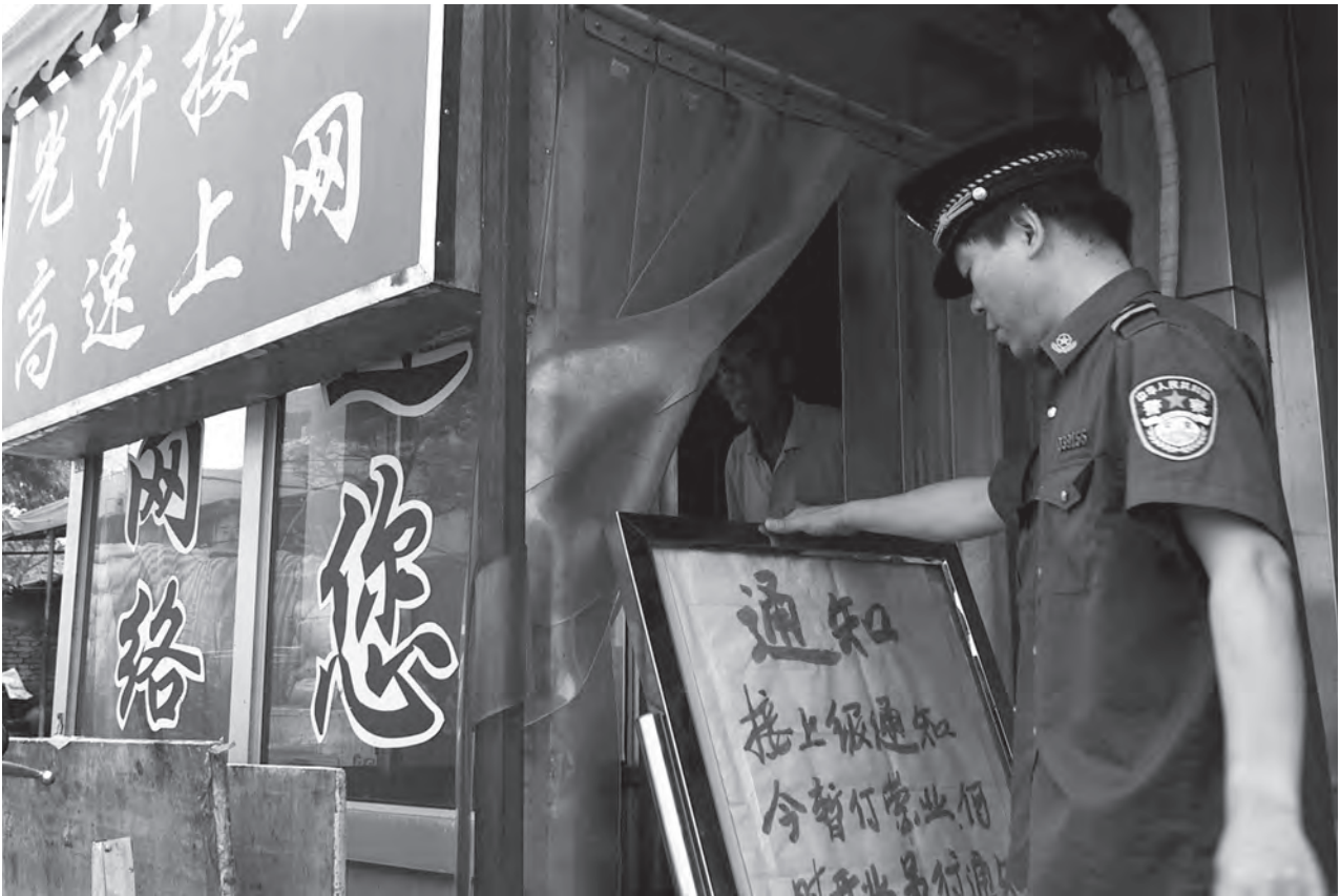
Policeman inspects a Beijing Internet café closed after 24 people died in a fire at an Internet café in June 2002.