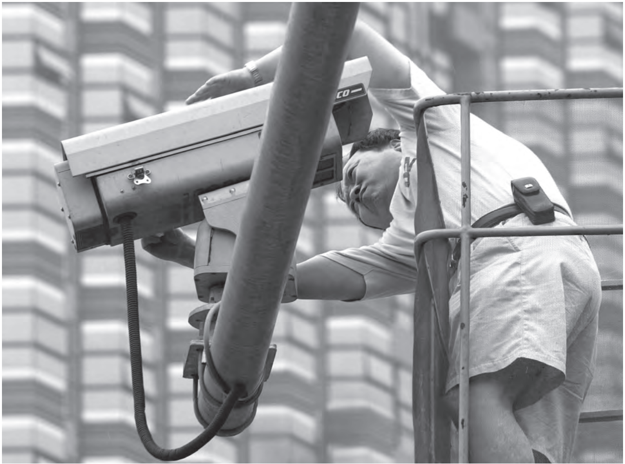
Chinese authorities are investing big money in security.

based Markle Foundation. UCLA's Center for Communication Policy launched the World Internet Project in 1999 with the goal of assessing the social impact of the Internet based on questionnaire surveys. There were two reasons why the World Internet Project had to commission the Chinese Academy of Social Sciences' Research Center for Social Development to conduct this survey: First, the Detailed Rules and Regulations on the Implementation of the Statistics Law of the People's Republic of China 71 and the Interim Measures for Administration of Foreign-Related Social Survey Activities 72 stipulate that foreign groups or individuals may not conduct independent statistical research within China, but must entrust officially approved Chinese organizations with this task. Second, all collected data must be examined and approved by Chinese government agencies before they can be delivered to foreign organizations.